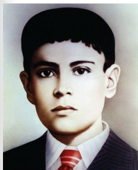
Saint José Luis Sánchez del Río Cristero Martyr 1913 - 1928 Canonized a Saint on 16 October 2016 Memorial - 10 February (Anniversary Date of His Martyrdom)

Yet Fr. Miguel Pro was not the only person to demonstrate such fearless faith. A movie released six years ago, “For Greater Glory,” recounts the struggle of several Christians (called Cristeros) who stood up to the tyranny that sought to undermine the Catholic Church. Particularly fascinating is the witness of Jose’ Sanchez del Rio (pictured left). He was 14 years old when he witnessed to the execution of his pastor, St. Christopher Magalles. He told his mother, “In order to go to Heaven, we have to go to war.” He begged her to permit him to accompany the Cristeros, saying “Never has it been so easy to obtain Heaven!”