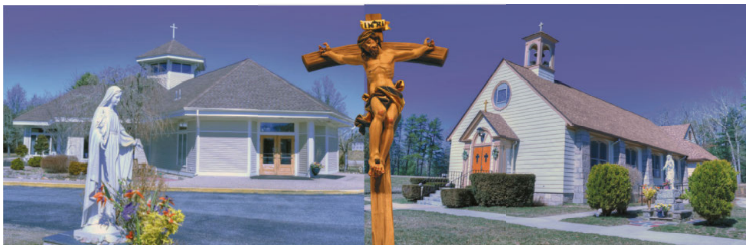
St. James Chapel - 2079 Matunuck School House Rd Charlestown, RI 02813

St. Mary's is a Stewardship Parish, comprised of the faith-filled communities of St. Mary's Church and St. James Chapel. Together, we are devoted to the spreading of the Gospel message of Jesus Christ through deeds, prayer and the sacrificial giving of our Time, our Talent and our Treasure.