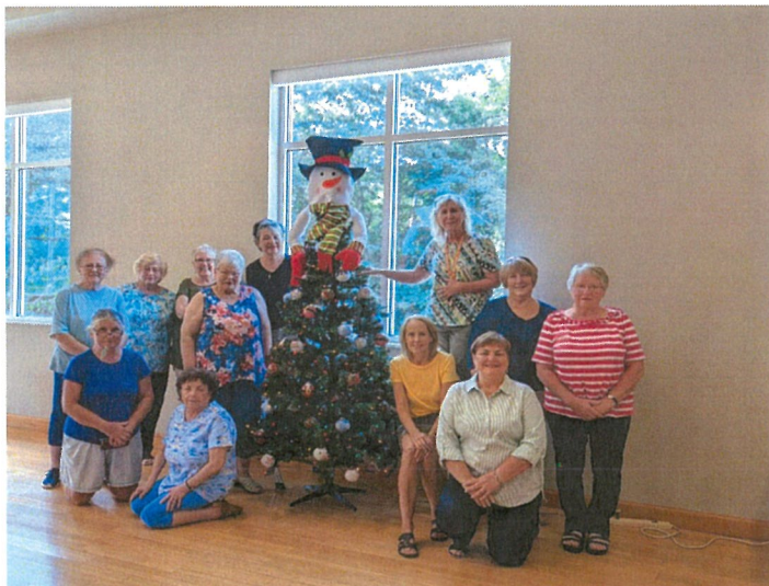
The Crafty Ladies current project – designing and decorating a tree for the East Tennessee Children's Hospital 'Fantasy of Trees' event in November.