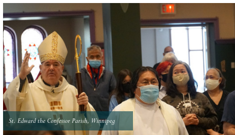
St. Edward the Confessor Parish, Winnipeg