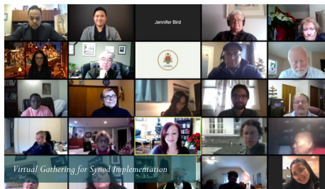
Virtual Gathering for Synod Implementation