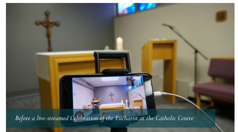
Before a live-streamed Celebration of the Eucharist at the Catholic Centre