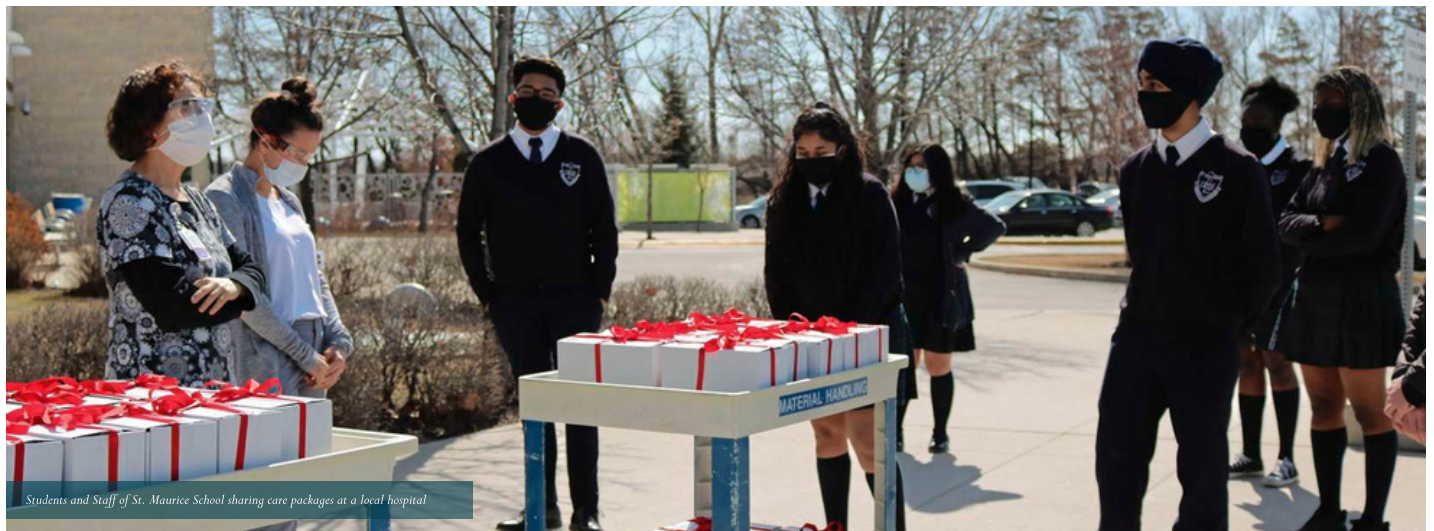
Students and Staff of St. Maurice School sharing care packages at a local hospital