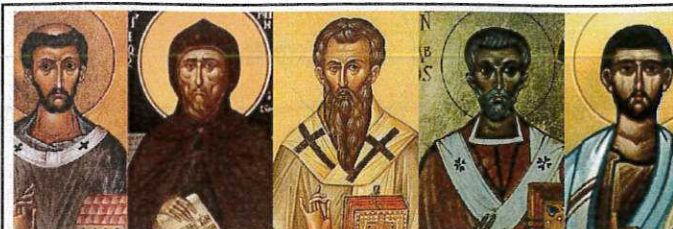
ST. JOHN CHRYSOSTOM

From 386-397 A.D. St. John Chrysostom served as a priest in the main church of Antioch. He soon became renown for his preaching and writing skills. In 397 A.D. he succeeded St. Gregory of Nazianz as Bishop of Constantinople.