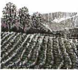
— Luke 9:62

But on the road to Damascus; he heard these words, 'Saul, Saul, why are you persecuting me?' By persecuting the followers of Jesus, Saul is persecuting Jesus himself. Saul becomes Paul, the greatest missionary of the early Church. Again, God does not look at outer appearance, but at the heart of a person.