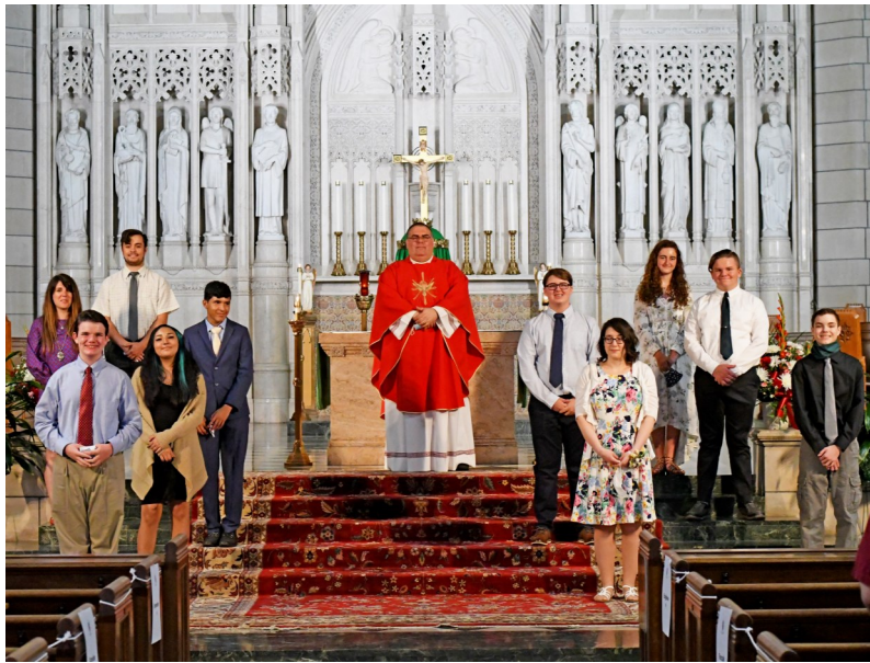
The newly confirmed gather for a group picture at the end of the Mass on June 25th.