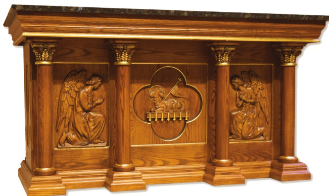
Sample image of the altar of repose.

On the Solemnity of Corpus Christi, we are happy to announce that the tabernacle is moving from its current location over to the center of the sanctuary. Such a move is significant, however, it is not without good reason. Following three years of Eucharistic Revival, there has been an increase in the number of Catholics returning to the Church and many converting to Catholicism. Our new Adoration Chapel of the Sacred Heart has already received over 400 visits since its opening just a few months ago. Many have a desire to be close to our Blessed Lord, and the new Adoration Chapel provides this in a most intimate way. The current location of the tabernacle in the church, however, is segregated from the sanctuary. Many visitors to our parish have difficulty finding the tabernacle. Having the tabernacle in the sanctuary will be more noticeable to visitors and more visible to the entire congregation.