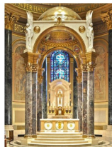
Cathedral Basilica of Sts. Peter & Paul (if time allows)

Family and friends are warmly welcome to share in this faith-filled journey of reflection, fellowship, and renewal. The pace will be easy, allowing time for prayer, quiet moments, and conversation along the way.