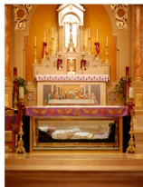
National Shrine of St. John Neumann