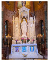
Miraculous Medal Shrine (lunch included)

We'll visit three shrines in the Philadelphia area: