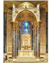
Cathedral Basilica of Sts. Peter & Paul (if time allows)

Family and friends are warmly welcome to share in this faith-filled journey of reflection, fellowship, and renewal. The pace will be easy, allowing time for prayer, quiet moments, and conversation along the way.