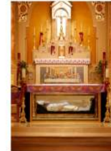
National Shrine of St. John Neumann