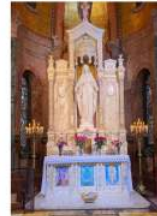
Miraculous Medal Shrine (lunch included)

We'll visit three shrines in the Philadelphia area: