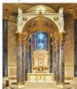
Cathedral Basilica of Sts. Peter & Paul (if time allows)