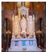
Miraculous Medal Shrine (lunch included)

We'll visit three shrines in the Philadelphia area: