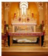
National Shrine of St. John Neumann