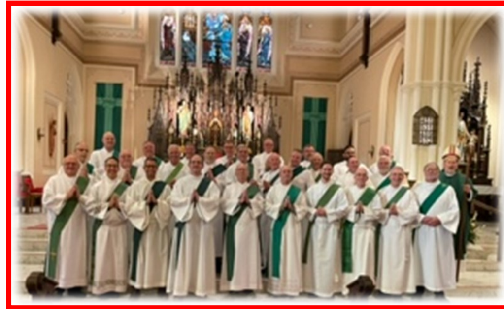
Deacons attending the Deacon Convocation 2022