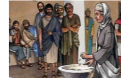
This Photo by Un-

Weekly Budget $ 2,300.00 Offertory $ 2,214.00 Building Fund $ 1,915.00