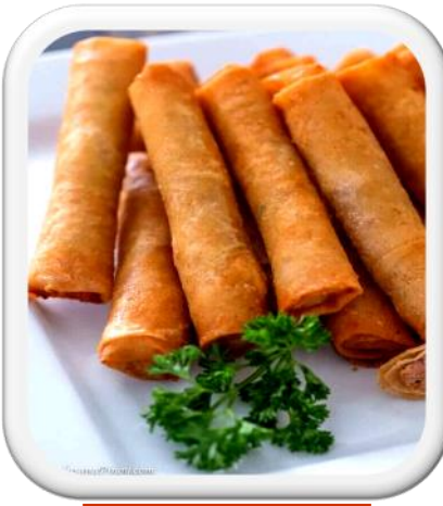
Vegetable Egg Roll Vegetable Lumpia