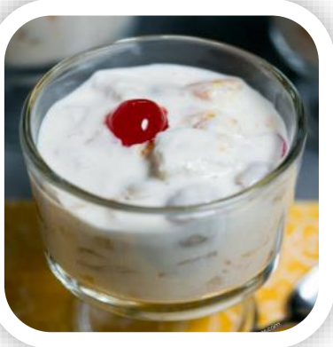
Filipino Fruit Salad Buko Salad