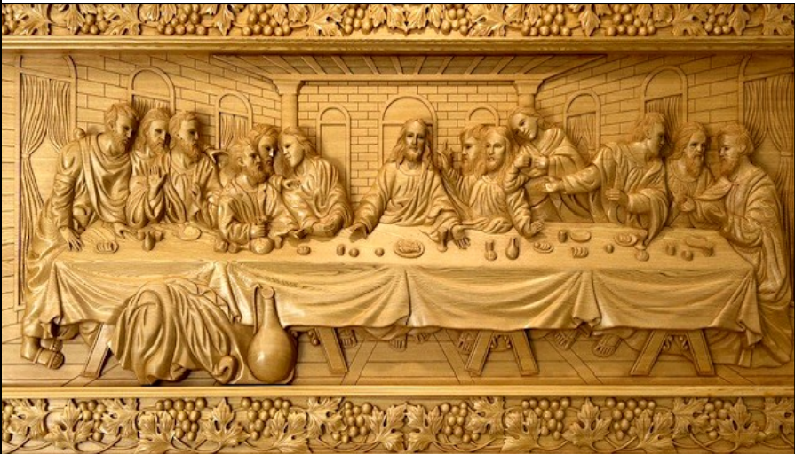
+ The Last Supper Lovingly Sponsored By Douglas and Kathleen DeAngelis

HML UPDATE WEEKEND 08. 09 -10. 2025 Our parish is continuing to chip away at our construction debt. Please check accounting update included in this bulletin for the latest financial snapshot. DONOR TREE LEAVES The first batch of engraved silver HML leaves, over 100 of them, have been ordered. We should have them in 4 or 5 weeks and we will immediately install them on our beautiful Donor Tree when they arrive. Heartfelt thanks are extended to all donors and sponsors who have supported the HML debt reduction effort! For anyone who has not yet offered a donation, more leaves can be ordered for your recognition on a permanently mounted bronze plaque adjacent to their sponsored item. ENGRAVED PAVERS The second batch of the engraved pavers recognizing our wonderful paver sponsors have been ordered. There are 47 pavers in this batch to go with the original 66 pavers. When the next batch arrives, they will be set permanently in the Holy Family Garden Walk path. Thanks to all for your participation in the HML paver program!