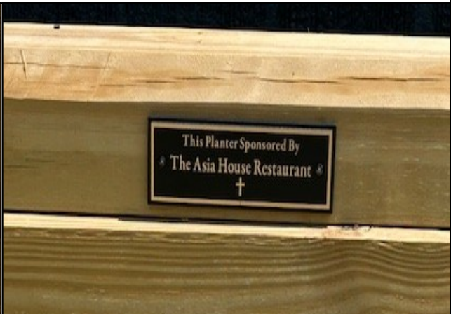
THIS PLANTER BOX SPONSORED BY THE ASIA HOUSE RESTAURANT