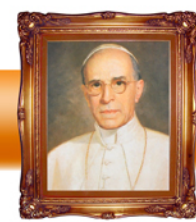
Venerable Pius XII (1859 - 1958)