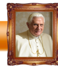
Pope Benedict XVI (2005 - 2013)