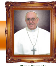
Pope Francis (2013 - Present)