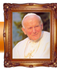
Saint John Paul II (1878 - 2005)