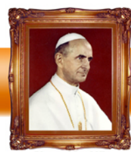
Blessed Paul VI (1863 - 1978)