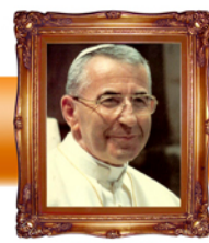
John Paul I (1878 - 1978)