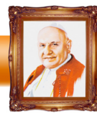
Saint John XXIII (1859 - 1963)