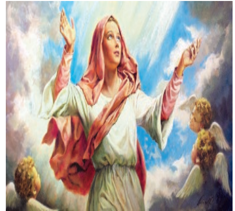
The Assumption of the Blessed Virgin Mary

Maternity of the Blessed Virgin Mary, Please Pray for Us and for Peace!