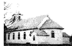
ST. MARY OF THE ASSUMPTION CATHOLIC CHURCH Megargel, Texas

ACRED HEART PASTORAL CENTER 206 N. CEDAR ST. SEYMOUR, TX 76380-2102 OFFICE (940) 889-5252 FAX (940) 889-2136