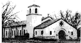
SACRED HEART CATHOLIC CHURCH Seymour, Texas

ACRED HEART PASTORAL CENTER 206 N. CEDAR ST. SEYMOUR, TX 76380-2102 OFFICE (940) 889-5252 FAX (940) 889-2136