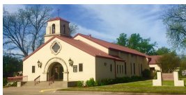
SACRED HEART CATHOLIC CHURCH Seymour, Texas

SACRED HEART PASTORAL CENTER 206 N. CEDAR ST. SEYMOUR, TX 76380-2102 OFFICE (940) 889-5252 FAX (940) 889-2136