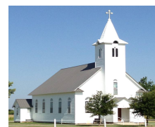
ST. MARY OF THE ASSUMPTION CATHOLIC CHURCH Megargel, Texas

SACRED HEART PASTORAL CENTER 206 N. CEDAR ST. SEYMOUR, TX 76380-2102 OFFICE (940) 889-5252 FAX (940) 889-2136