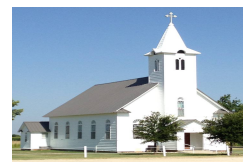
ST. MARY OF THE ASSUMPTION CATHOLIC CURCH Megargel, Texas

SACRED HEART PASTORAL CENTER 206 N. CEDAR ST. SEYMOUR, TX 76380-2102 OFFICE (940) 889-5252 FAX (940) 889-2136