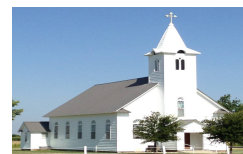
ST. MARY OF THE ASSUMPTION CATHOLIC CHURCH Megargel, Texas

SACRED HEART PASTORAL CENTER 206 N. CEDAR ST. SEYMOUR, TX 76380-2102 OFFICE (940) 889-5252 FAX (940) 889-2136