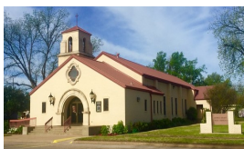
SACRED HEART CATHOLIC CHURCH Seymour, Texas

SACRED HEART PASTORAL CENTER 206 N. CEDAR ST. SEYMOUR, TX 76380-2102 OFFICE (940) 889-5252 FAX (940) 889-2136