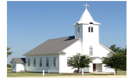
ST. MARY OF THE ASSUMPTION CATHOLIC CHURCH Megargel, Texas

SACRED HEART PASTORAL CENTER 206 N. CEDAR ST. SEYMOUR, TX 76380-2102 OFFICE (940) 889-5252 FAX (940) 889-2136