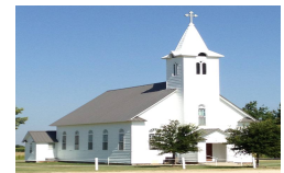
ST. MARY OF THE ASSUMPTION CATHOLIC CHURCH Megargel, Texas

SACRED HEART PASTORAL CENTER 206 N. CEDAR ST. SEYMOUR, TX 76380-2102 OFFICE (940) 889-5252 FAX (940) 889-2136