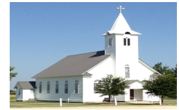
ST. MARY OF THE ASSUMPTION CATHOLIC CHURCH Megargel, Texas

SACRED HEART PASTORAL CENTER 206 N. CEDAR ST. SEYMOUR, TX 76380-2102 OFFICE (940) 889-5252 FAX (940) 889-2136