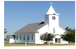
ST. MARY OF THE ASSUMPTION CATHOLIC CURCH Megargel, Texas

SACRED HEART PASTORAL CENTER 206 N. CEDAR ST. SEYMOUR, TX 76380-2102 OFFICE (940) 889-5252 FAX (940) 889-2136