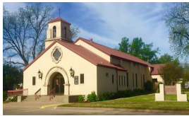
SACRED HEART CATHOLIC CHURCH Seymour, Texas

SACRED HEART PASTORAL CENTER 206 N. CEDAR ST. SEYMOUR, TX 76380-2102 OFFICE (940) 889-5252 FAX (940) 889-2136