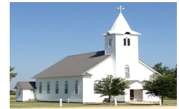
ST. MARY OF THE ASSUMPTION CATHOLIC CHURCH Megargel, Texas

SACRED HEART PASTORAL CENTER 206 N. CEDAR ST. SEYMOUR, TX 76380-2102 OFFICE (940) 889-5252 FAX (940) 889-2136