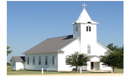
ST. MARY OF THE ASSUMPTION CATHOLIC CURCH Megargel, Texas

SACRED HEART PASTORAL CENTER 206 N. CEDAR ST. SEYMOUR, TX 76380-2102 OFFICE (940) 889-5252 FAX (940) 889-2136