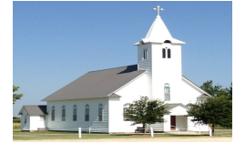
ST. MARY OF THE ASSUMPTION CATHOLIC CHURCH Megargel, Texas

SACRED HEART PASTORAL CENTER 206 N. CEDAR ST. SEYMOUR, TX 76380-2102 OFFICE (940) 889-5252 FAX (940) 889-2136