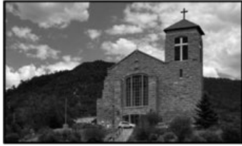
Saint Joseph Apache Mission Mescalero Apache Reservation, New Mexico

Always be ready to give the reason for your hope. [1 Peter 3:15]