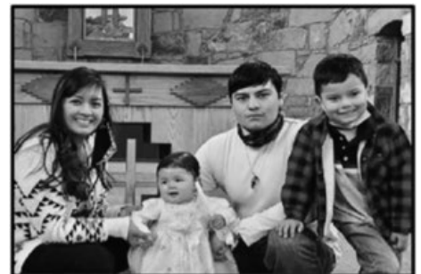
Christmas Blanket Drive