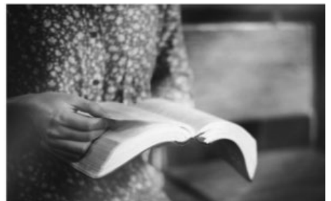
Excerpts from the Lectionary for Mass ©2001, 1998, 1970 CCD. The English translation of Psalm Responses from Lectionary for Mass © 1969, 1981, 1997, International Commission on English in the Liturgy Corporation. All rights reserved.

2 Sm 7:1-5, 8b-12, 14a, 16/Ps 89:2-3, 4-5, 27, 29 (2a)/Rom 16:25-27/Lk 1:26-38