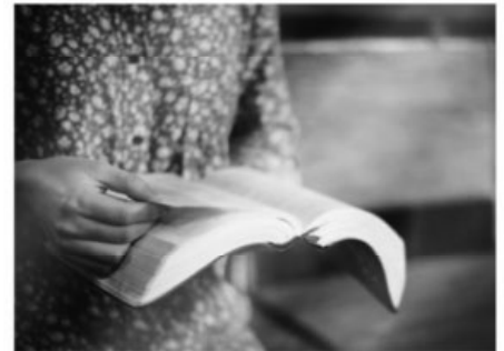
Excerpts from the Lectionary for Mass ©2001, 1998, 1970 CCD. The English translation of Psalm Responses from Lectionary for Mass © 1969, 1981, 1997, International Commission on English in the Liturgy Corporation. All rights reserved.

Ez 2:2-5/Ps 123:1-2, 2, 3-4 (2cd)/2 Cor 12:7-10/Mk 6:1-6a