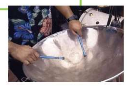
WITH "ATIBA" ON THE STEEL DRUM

SPONSORED BY THE SODALITY OF THE BLESSED VIRGIN MARY OF ST. JOSEPH CHURCH ON FRENCH ST.