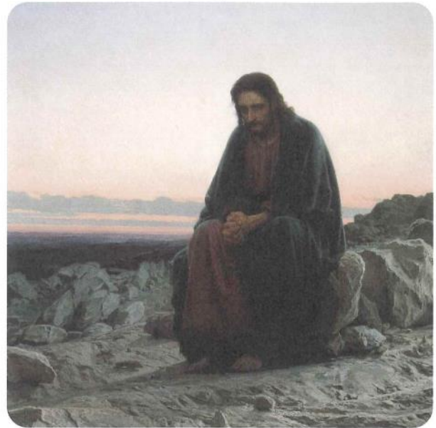
CHRIST IN THE WILDERNESS BY IVAN KRANSKOV, 1872