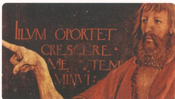
DETAIL OF THE ISENHEIM ALTARPIECE BY MATTHIAS GRÜNEWALD, WIKIMEDIA COMMONS