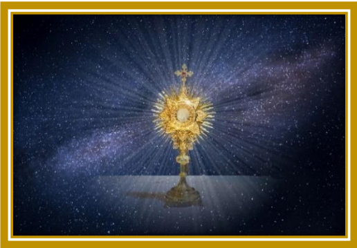
The Science and Significance of Eucharistic Miracles Sunday October 9 at 7:00 pm in the Gym

Please sign up to spend some time before the Blessed Sacrament during the adoration times listed above. Sign up sheets are in the back of Church. We need at least two adorers at all times while the Blessed Sacrament is exposed on the altar.