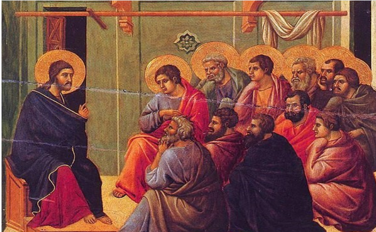
Duccio di Buoninsegna, ca. 1308