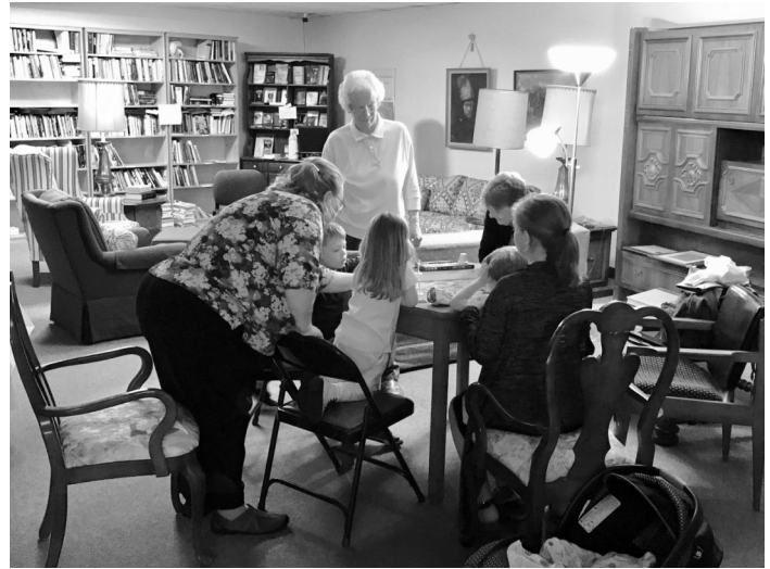
The sisters entertaining the children