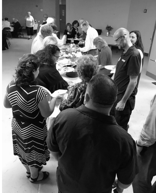
The Supper Buffet

The evening opened with hors d'oeuvres and an ice breaker that helped the group to get to know one another. This was followed by a delicious meal which everyone enjoyed tremendously.