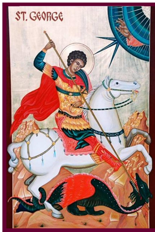
Under the protection of Saint George in Christ Jesus