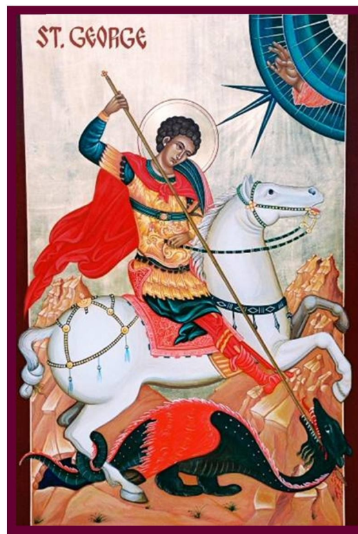
Under the protection of Saint George in Christ Jesus