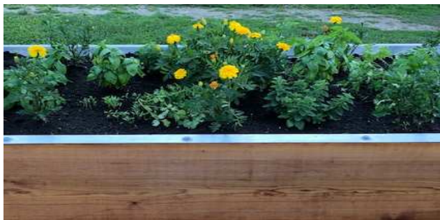
Herb and flower box made by our Confirmation Candidates is being enjoyed by everyone at the Mustard Seed.