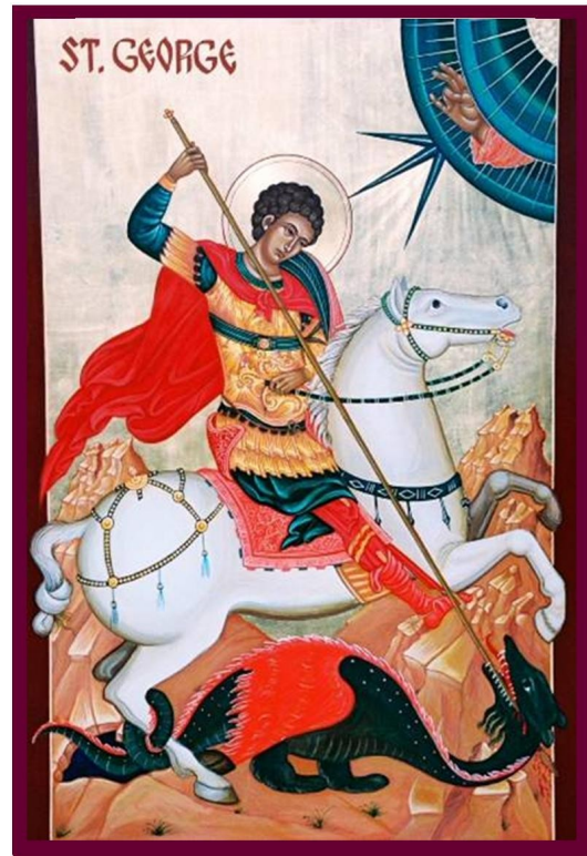
Under the protection of Saint George in Christ Jesus