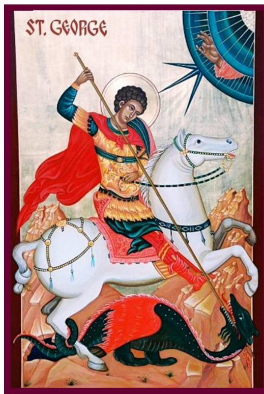
Under the protection of Saint George in Christ Jesus