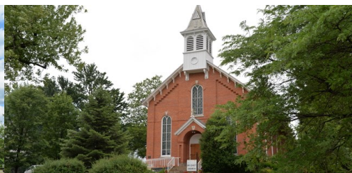
ST. BRIDGET'S CHURCH 15 Church Street Bloomfield, NY 14469