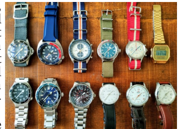
(Picture for example only. These are not the actual watches available.)

As long as available, the watches will given out one per client family.