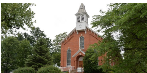
ST. BRIDGET'S CHURCH 15 Church Street Bloomfield, NY 14469

NOW, MORE THAN EVER, we ought to understand the mission of Catholic education and Catholic educators. We need to acknowledge the truly divine call of our teachers and staff, most especially here at St. Mary's School. The call of dedication and true commitment to each and every student who walks through the doors. The call of selfless service.