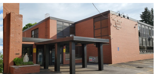
ST. MARY'S SCHOOL 16 Gibson Street Canandaigua, NY 14424