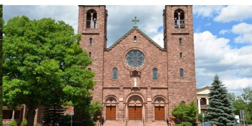
ST. MARY'S CHURCH 95 North Main Street Canandaigua, NY 14424