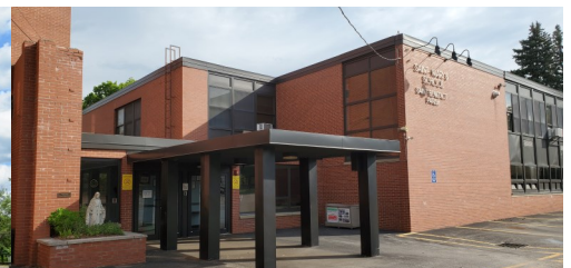
ST. MARY'S SCHOOL 16 Gibson Street Canandaigua, NY 14424