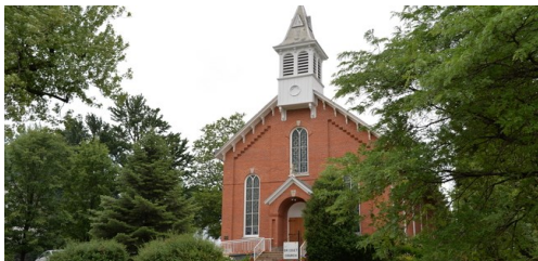
ST. BRIDGET'S CHURCH 15 Church Street Bloomfield, NY 14469

NOW, MORE THAN EVER , as parents, guardians, and caregivers, we need to be invested in our children's formative years. As parishioners, we ought to view our parochial school as a mission, an extension of our Catholic faith. It is an avenue by which we share the Gospel with all our brothers and sisters, no matter their faith or disbelief. We must call upon the Holy Spirit to utilize to discern how our time, talents, or treasures can support St. Mary's School so that it can remain a beacon of hope as each graduate leaves with a strong sense of their Catholic identity and a deeply rooted education.