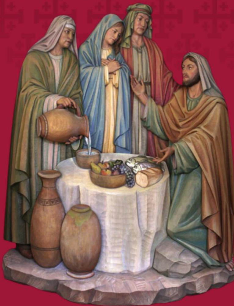
Sts. Martha, Mary and Lazarus