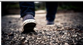
Christ Doesn't Lie

My God, Lord, how long? I thought. How much longer? Will this suffering that I had already endured for years never end? And I had a very decisive moment of clarity. I thought, Christ never lied. He never said that following him was going to be easy. He said, "For the gate is narrow and the road is hard that leads to life, and there are few who find it," (Matthew 7:14), and that's because to go through the narrow gate hurts. It hurts like hell. It hurt for him, and he never lied.