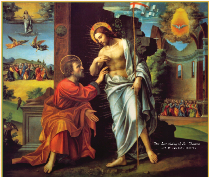
The Incredulity of St. Thomas ARTIST AND DATE UNKNOWN

Concerning later events in the apostle's life very meager information exists. The Martyrology has this: "At Calamina (near Madras in India) the martyrdom of the apostle Thomas - he announced the Gospel to the Parthians, and finally came to India. After he had converted numerous tribes to Christianity, he was pierced with lances at the king's command."