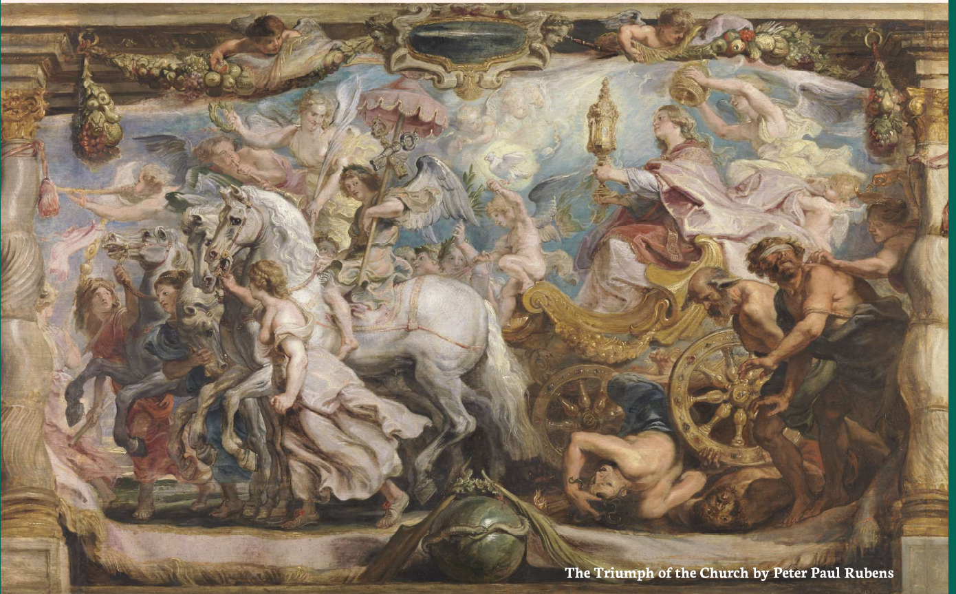
The Triumph of the Church by Peter Paul Rubens